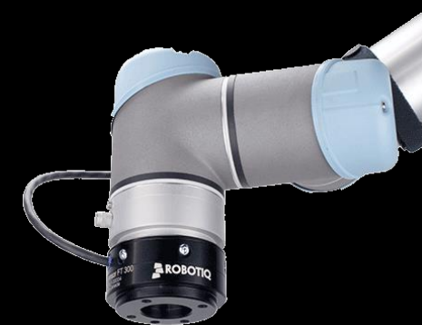
Image credits RealSense Camera, Intel Robotiq Force Torque Sensor, Universal Robots